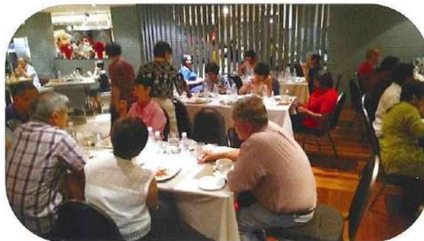
Some of the Board members