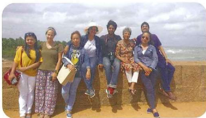
Outing day to Kanyakumari which was included in the training schedule. Organized by Pallium India. All expenses were borne by the participants.