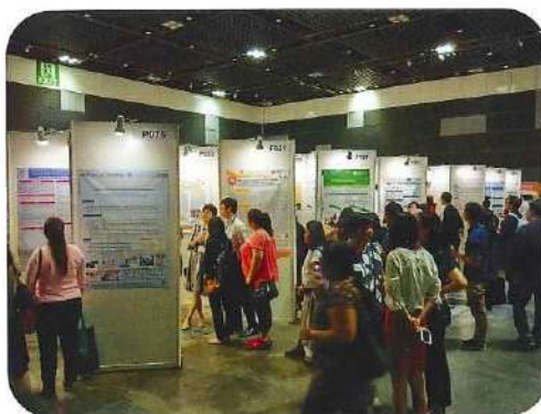
The poster competition & exhibition area.