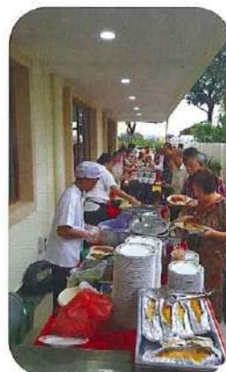
Guests tucking into the sumptuous spread!