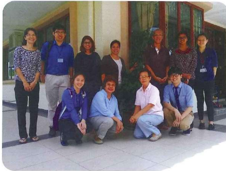
Second group of UTAR 4th year medical students with our team on 14 December 2017

In December 2017, we had the opportunity to host eight 4th year medical students from UTAR who were doing their family medicine posting. The posting involved a segment on palliative care, and they were interested to have a 1-day attachment with ASPAC to be exposed to what community palliative care was all about.