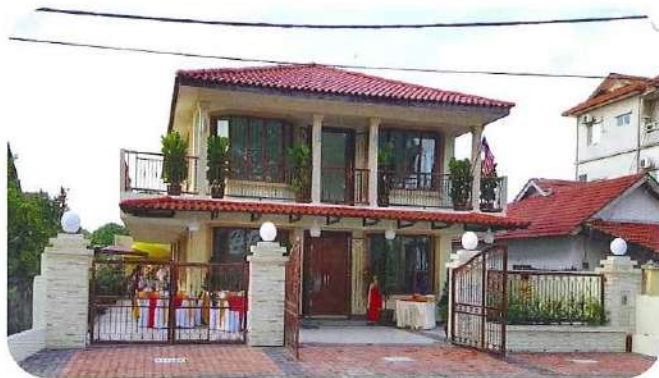
ASPAC's New Office