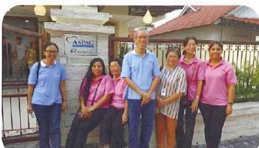
Some of the ASPAC staff