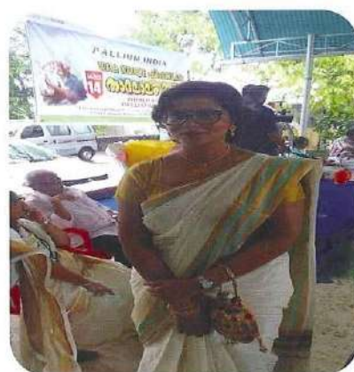
World Palliative Care Day Celebrations on 14 October 2017

“ THOSE WHO HAVE THE STRENGTH AND THE LOVE TO SIT WITH A DYING PATIENT IN THE SILENCE THAT GOES BEYOND WORDS WILL KNOW THAT THIS MOMENT IS NEITHER FRIGHTENING NOR PAINFUL, BUT A PEACEFUL CESSATION OF THE FUNCTIONING OF THE BODY. ”