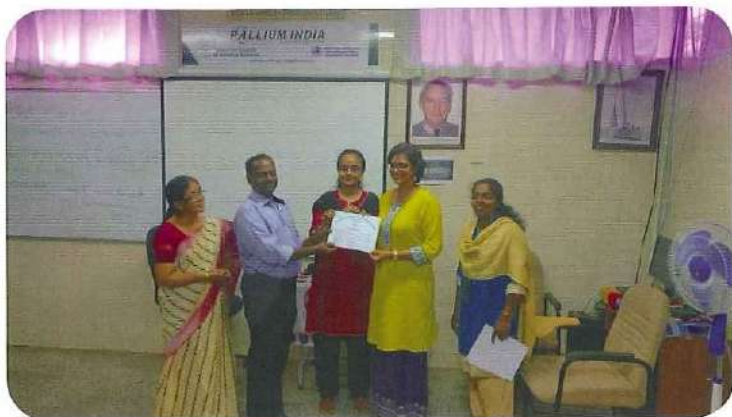
Receiving the certificate from Pallium India upon successfully completing the training.

Overall, the training was a great experience as I learned about a different culture, management and learning points.