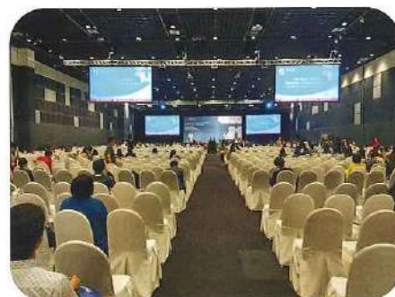
The massive Convention Hall!